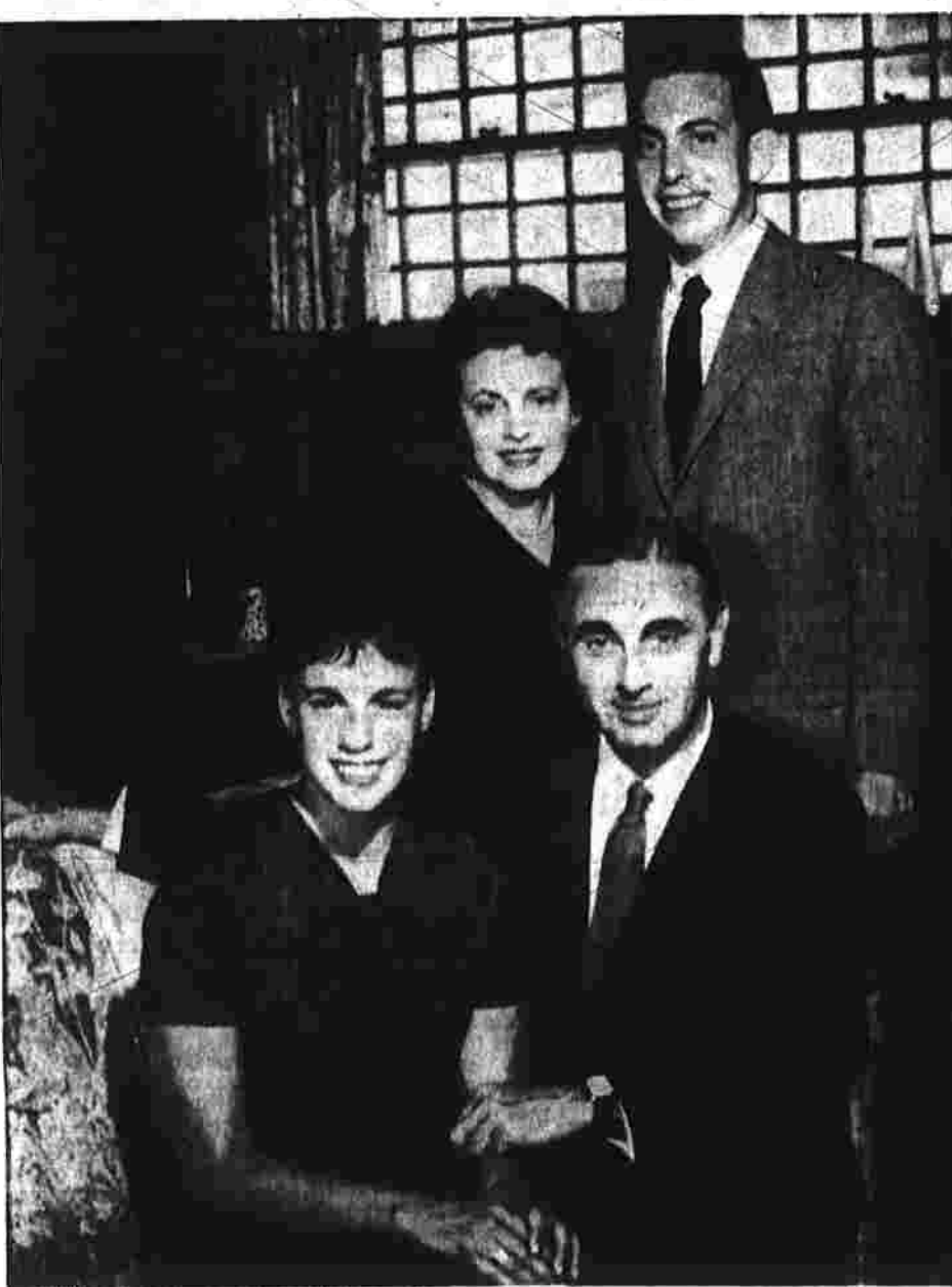
The Ribicoff Family—Abe, his wife Ruth, Peter and Jane.

From An Editorial in the Deep River New Era, July 10, 1958